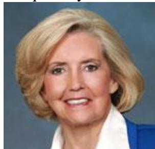
Lilly Ledbetter (1938) Equal Pay Activist

Lilly Ledbetter took her case of employment discrimination all the way to the U.S. Supreme Court and beyond. Today she is a women’s rights and civil rights activist and sought after speaker. Ledbetter grew up near Jacksonville, Alabama; she is married, had two children, and worked various office jobs. In 1979 she got her dream job working as a manager at the